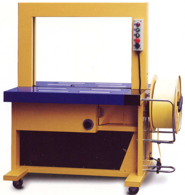
AAM-616 AUTOMATIC STRAPPING MACHINE