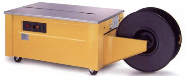
AAM-611 LOW BED TYPE STRAPPING MACHINE