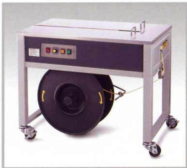
AAM-612 DESK TYPE STRAPPING MACHINE