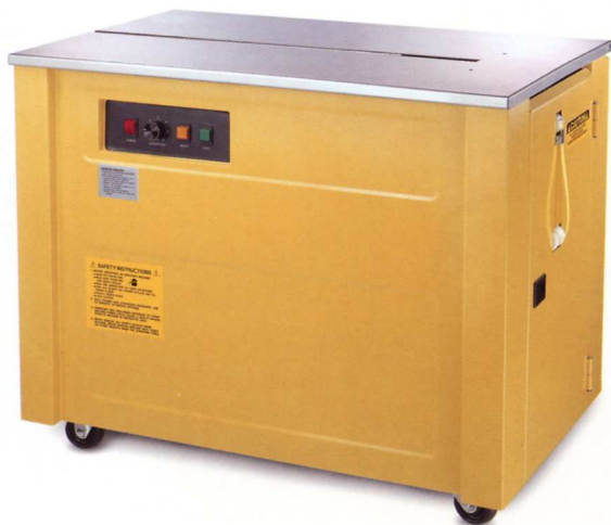
AAM-613 INSTANT HEATING TYPE STRAPPING MACHINE